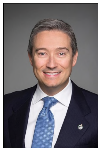
The Honourable François-Philippe Champagne Minister of Innovation, Science and Industry

We invite you to read this report to learn more about the many achievements for Canada in Space in 2022–23 and how the ISED Portfolio is working together with Canadians of all